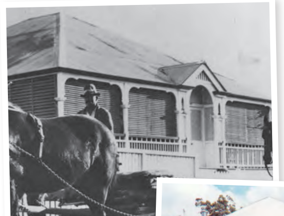
Old and new : The Cowin family residence at 40 Villiers St (showing the last horse and dray before trucks took over); and (right) the house soon after arriving in Fig Tree Pocket.

While the grand old lady of New Farm is lost to Villiers St, it lives on in picturesque Fig Tree Pocket with commanding views — so it is not lost for those who relish the pleasure of viewing old Queenslanders.