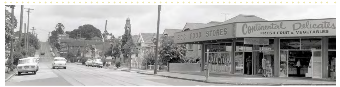
Where were you in 1969?: You'll recognise Brunswick St near Sydney St–but there are no overhead tram wires, so it must have been after 13 April 1969 when the last Brisbane tram ran. Thanks to Lindsay Cripps on FB, for this striking BCC photo (B54-32286).

Every artist was first an amateur... - Ralph Waldo Emerson