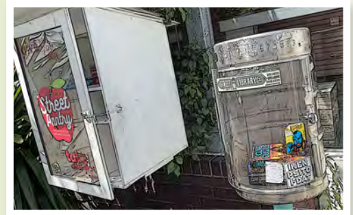
Food and books on offer: A spot on Brunswick St outside the Brunswick Hotel currently offers a 'Street Pantry' and 'Street Library', thoughtfully offering some free sustenance for both body and mind. Congratulations to those behind this initiative.