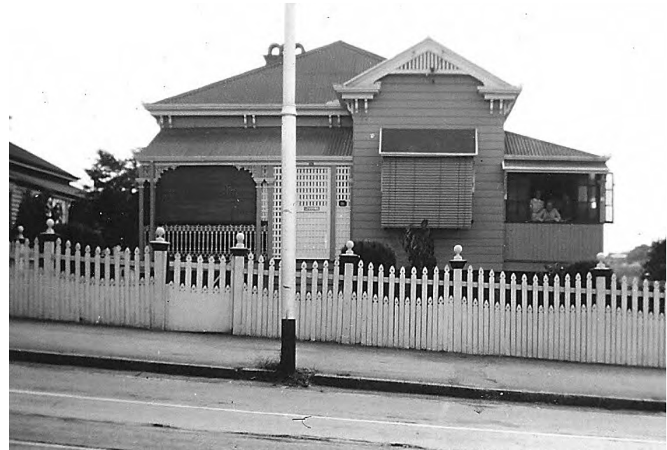
A view from 1938 of the Queenslander at 562 Brunswick St, a spot now occupied by the carpark of IGA Marketplace.