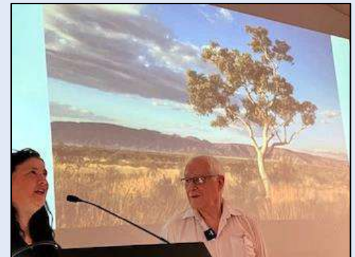
Australian English - from a mere sapling to a healthy mature tree

The good professor informed and entertained us with the fascinating story of Australian English to which, by the way, Queensland has contributed quite a lot*. In summary, then, Australian English, a mere sapling in 1901, is now a healthy mature tree developing in response to events, influences and cultural conditions. In other words, its future lies with us.