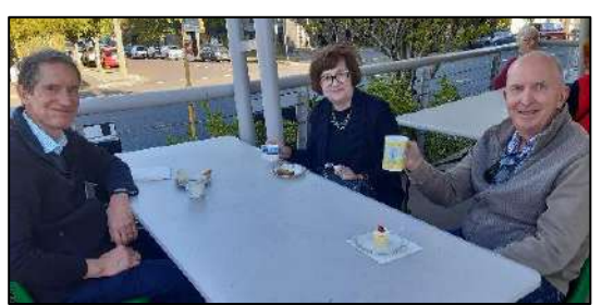
Plenty of discussion ensued, while afternoon tea was enjoyed indoors and outdoors in the courtyard and on the yeranda.